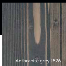
Anthracite grey 1826